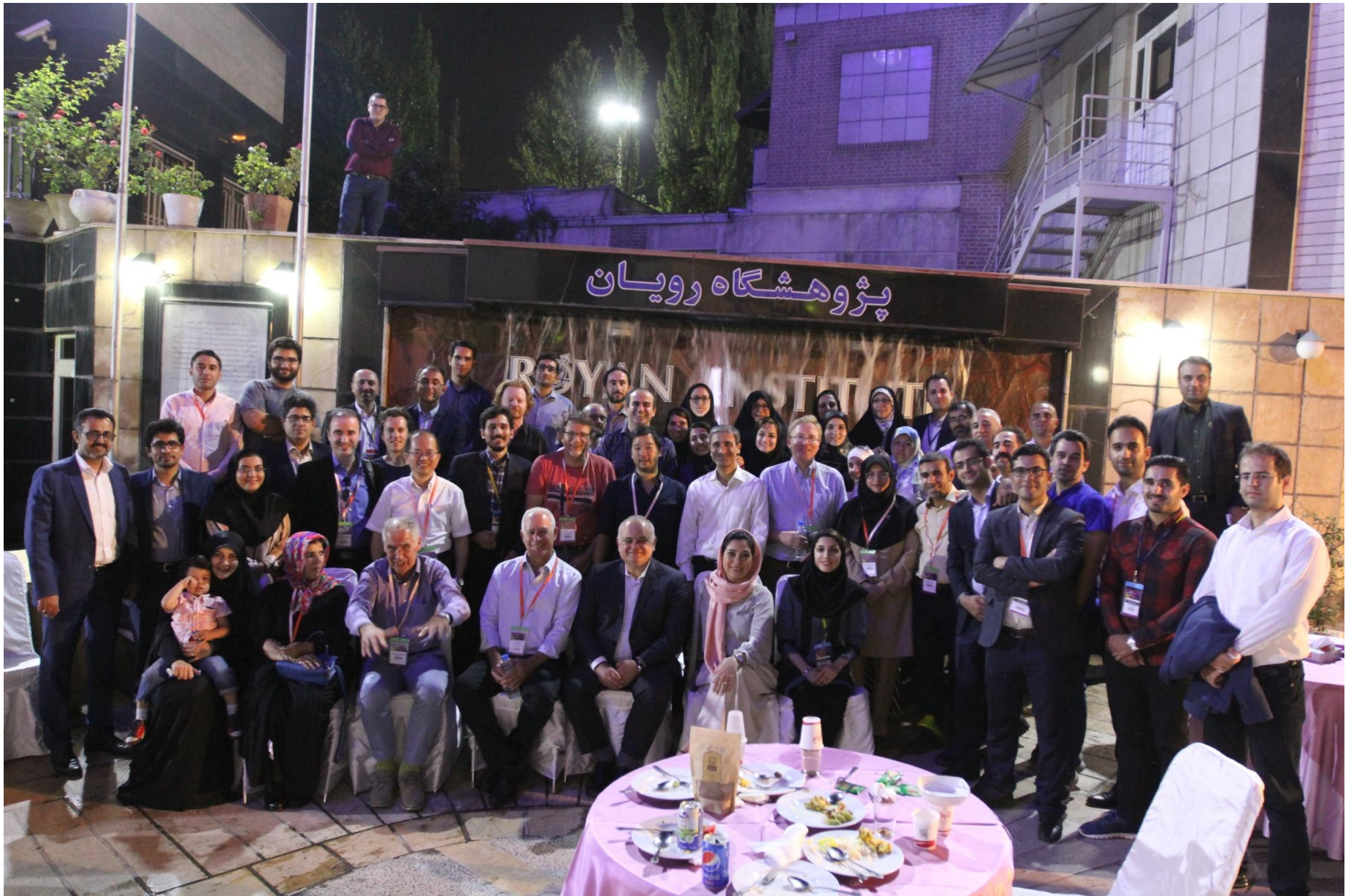
Royan Institute Dinner Party